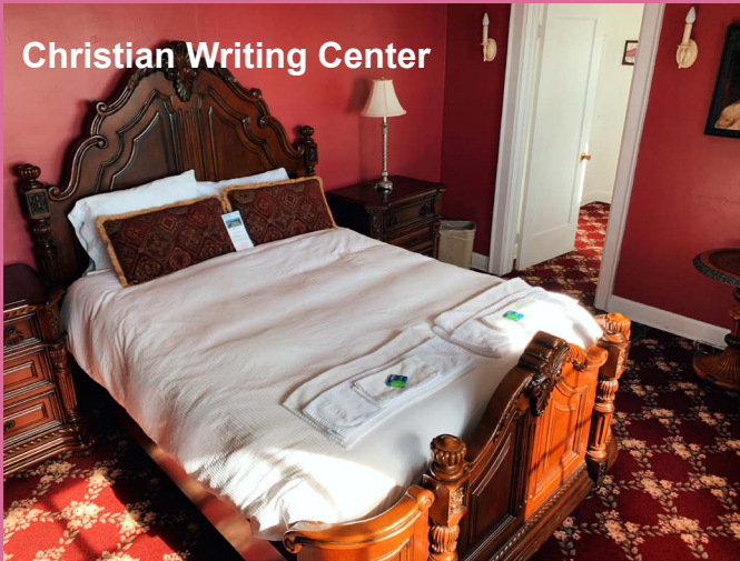
Christian Writing Center